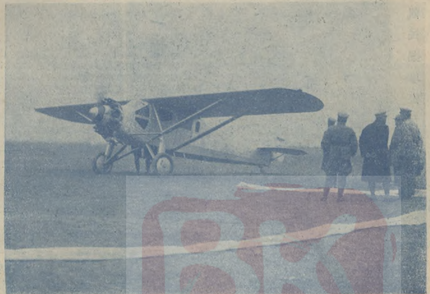
The commercial aeroplane "Hankow" starting on its trip to Canton

漢口民用飛機「漢口」號出發攝影 駕駛水上飛機「珠江」號飛行全國之飛機師陳慶雲手中之模型係梧州總商會所贈之紀念品