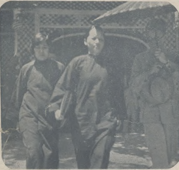
Mme. Sun Yat-sen accompanied by Mrs. Sun Fo in entering the Pi-yun Temple