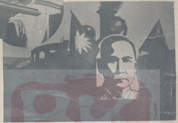
The locomotive for conveying Dr. Sun's remains. In cricle, the loudspeakers installed on the Special Train