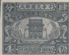
總理國墓紀念郵票 Dr. Sun's state Burial Memorial stamp